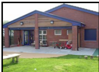
Meanwood Children's Centre